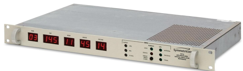
4411A GPS Disciplined Crystal Oscillator Reference

Year, day, and time-of-day are displayed on the front panel. The standard Ethernet connection simplifies integration with complex systems by allowing health and status information to be monitored remotely.